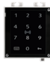
2N® ACCESS UNIT 2.0 TOUCH KEYPAD & RFID