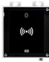
2N® ACCESS UNIT 2.0 BLUETOOTH & RFID