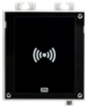
2N® ACCESS UNIT 2.0 RFID