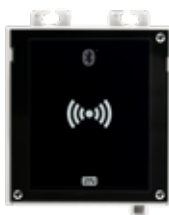
2N® ACCESS UNIT 2.0 BLUETOOTH & RFID