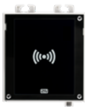
2N® ACCESS UNIT 2.0 RFID