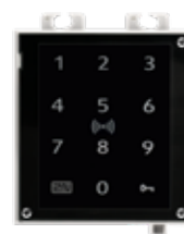
2N® ACCESS UNIT 2.0 TOUCH KEYPAD & RFID