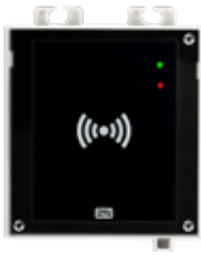
2N® ACCESS UNIT RFID