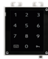
2N® ACCESS UNIT TOUCH KEYPAD