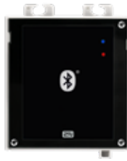
2N® ACCESS UNIT BLUETOOTH