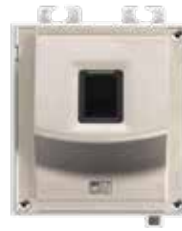
2N® ACCESS UNIT FINGERPRINT READER