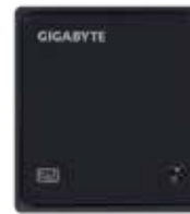
2N® ACCESS COMMANDER BOX