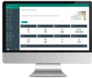
2N® ACCESS COMMANDER