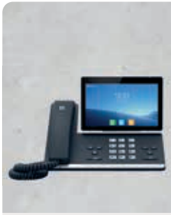
2N® IP PHONE D7A 02660-001