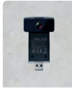
USB CAMERA 02659-001