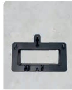
WALL MOUNT BRACKET 02530-001