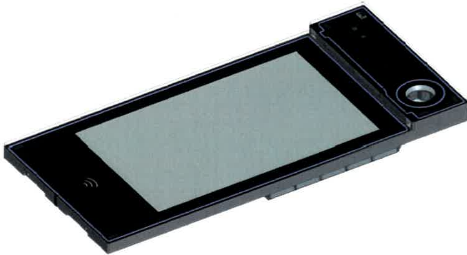
Fig. 1 Assessed product – front side

The protection degree (IP code) was assessed on product Intercom, type designation 2N® IP Style, Order number 9157xxx.